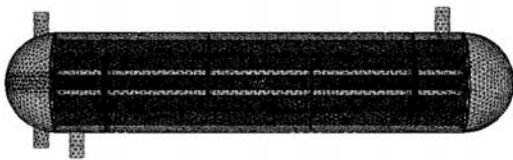
Figure 1. Three-dimensional grid of the heat exchanger

The unsteady-state condenser model was considered, based on the alpha-condenser model. Energy and mass balances were derived to solve for the temperature profiles and the amount of condensate. A program was developed to calculate the above and a commercial fluid dynamic simulator (FLUENT) was used to solve for flow field and temperature profiles along the heat exchanger in order to validate the results obtained from the computer program. The simulator was also used to test current exchanger calculations methods, such as the log-mean-temperature-difference, to justify the need for more accurate models.